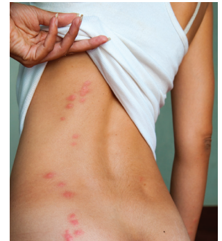
VICTIM OF BEDBUG BITES: A young woman shows numerous bedbug bites on her back and buttocks. Bedbugs feed on human blood, and their bites can leave red, itchy welts. Even worse, they defecate as they feed!

PERMA-Guard™ DE is a natural powder formula which is made up of the fossilized shells of microscopic organisms called diatoms. It clings to bedbugs and other insects, including ants, box elder bugs, carpet beetles, centipedes, crickets, cockroaches, earwigs, fleas, grasshoppers, millipedes, slugs and silverfish on contact, and unlike chemical pesticides, DE works by absorbing through the insects' outer shells, causing them to dehydrate and die. Bedbugs and other insects will not develop a resistance to